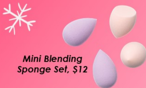
Mini Blending Sponge Set, $12