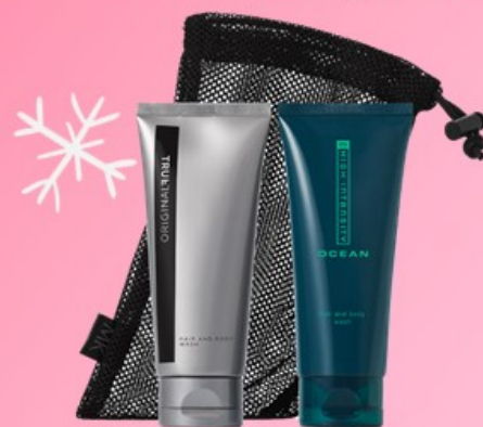
Men's Hair and Body Wash Gift Set, $26