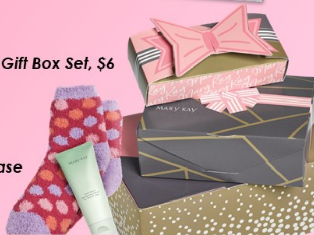
Gift With Purchase