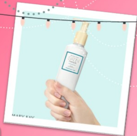
Satin Hands® Shea Hand Soap, $10