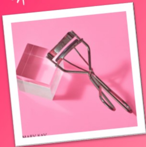
Eyelash Curler, $12