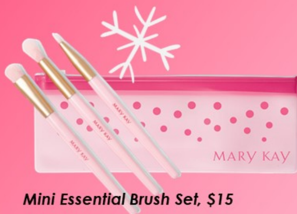
Mini Essential Brush Set, $15