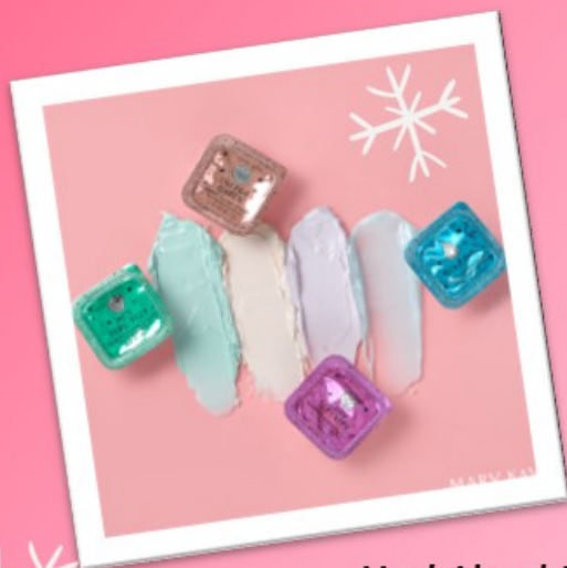
Mad About Masking® Mask Pod Gift Set, $25